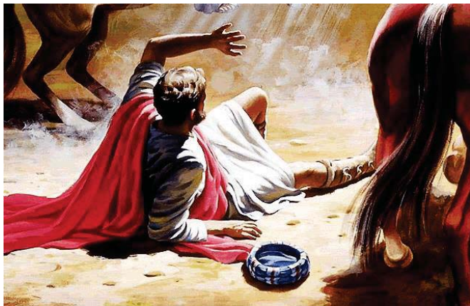
The Story of the Conversion of Saint Paul

Saint Paul's entire life can be explained in terms of one experience—his meeting with Jesus on the road to Damascus. In an instant, he saw that all the zeal of his dynamic personality was being wasted, like the strength of a boxer swinging wildly. Perhaps he had never seen Jesus, who was only a few years older. But he had acquired a zealot's hatred of all Jesus stood for, as he began to harass the Church: "...entering house after house and dragging out men and women, he handed them over for imprisonment" (Acts 8:3b). Now he himself was "entered," possessed, all his energy harnessed to one goal—being a slave of Christ in the ministry of reconciliation, an instrument to help others experience the one Saviour.